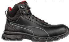
CONDOR BLACK MID 630101